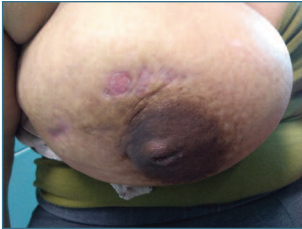
FIGURE 1. Right breast with persistent thickening of the upper outer quadrant associated with inflammatory skin lesions